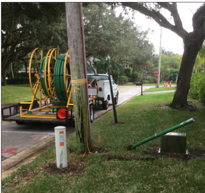
Orenco Effluent Sewers' affordability stems primarily from their use of small-diameter mainlines, which can be installed with minimal disturbance to neighborhoods.

According to Bolton, the installation time required for an effluent sewer system is less than a quarter of that required for a conventional gravity sewer. Directional boring (generally not possible for gravity sewer installations) was used in Vero Beach to minimize the impact of construction on both the public and the environment. This less-intrusive construction method reduces a number of unfavorable by-products of the construction process, including adverse environmental impacts, permitting concerns, problems with handling and disposing of excavated soils and groundwater,