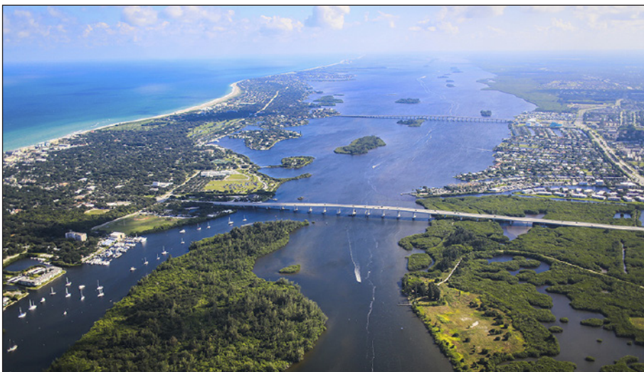
Concerned about nutrient runoff to the adjacent lagoon, the City of Vero Beach installed an Orenco Effluent Sewer, a much less-expensive and less-intrusive option than extending the city's gravity sewer.

Due to financial constraints, sewerage small cities like Vero Beach has long been an extreme challenge. For decades, engineers have encountered difficulties identifying affordable and viable wastewater solutions