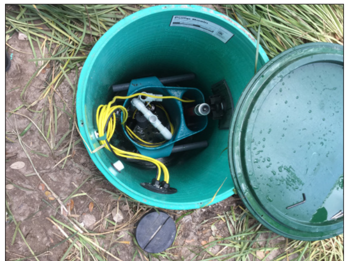
The city owns and operates the entire effluent sewer infrastructure, including the on-lot tank and pump package at each home.