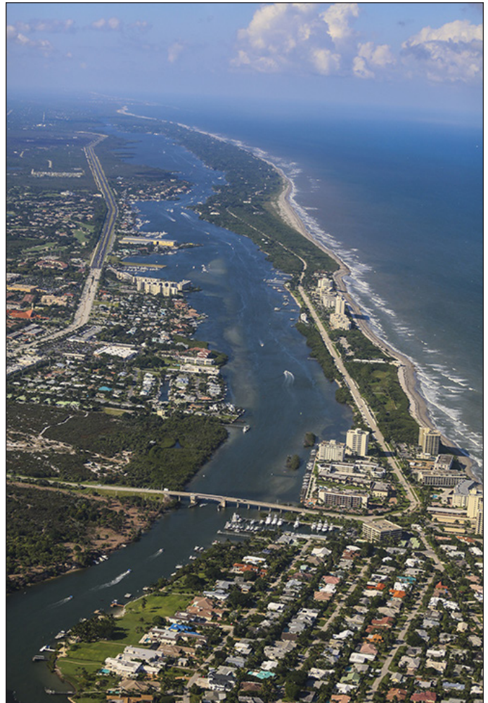
The total cost of installing an Orenco Effluent Sewer in Vero Beach was estimated to be half the cost of expanding the city's gravity sewer.

The first 2-inch (50-mm) collection lines and on-lot STEP packages were installed in the spring of 2015. A total of 1,500 residences are expected to opt in before the project is complete. The majority of homes will have a new, watertight 1,000-gallon (3,800-L) tank and STEP package installed at an estimated cost of $7,000 (installation plus materials) per connection. However, if a home was recently constructed and the city deems the existing septic tank to be watertight and structurally sound, the tank will be retained and the cost of construction will be reduced to about $5,600. In this case, the on-lot component design includes a simple, 100-gallon (380-L) pump chamber installed immediately following the existing tank (see photo at right). Once connected to the Orenco Effluent Sewer system, primary-treated effluent from each