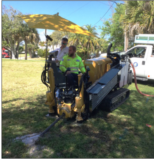
Trenchless construction is a less-intrusive method for installing new pipes while reducing negative environmental impacts and disruption to residents.

In Vero Beach, the minimal construction impact of the new Orenco Effluent Sewer was appreciated, especially considering that a significant percentage of the city’s residential lots are located on narrow streets and contain large homes surrounded by mature and established live oak trees. In fact, a substantial number of homes that are expected to connect to the system are located on lots of 0.3 acres (.12 ha) or less. Table 1 shows lot size data for the Bethel Creek area, which is representative of the city.