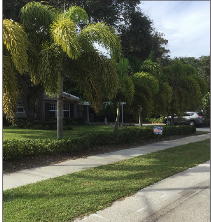
Further extending gravity sewer was too expensive and disruptive due to the small lots and mature trees common throughout Vero Beach.

The dramatically lower cost of an Orenco Effluent Sewer is largely attributed to its use of small-diameter mainlines laid at a constant depth to follow the con-