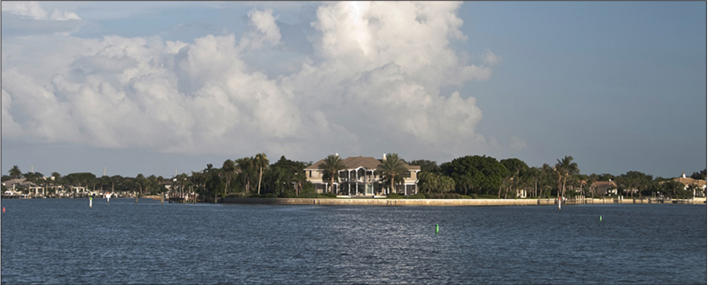
Connecting an estimated 1,500 residences to the city's new Orenco Effluent Sewer should dramatically improve water quality in the lagoon.

home's on-lot STEP package is pumped to the city's central wastewater treatment facility.