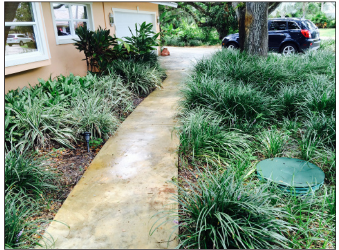
Each home connected to the system has an Orenco STEP package, including a 1,000-gal (3.8-m 3 ) watertight tank and an energy-efficient, low-horsepower pump that conveys effluent to the treatment plant.

the number and cost of utility conflicts and resulting relocations, and the high costs of surface restoration. 4