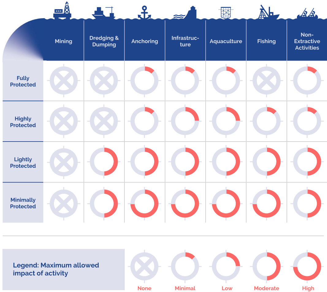
Fig. 1. Level of protection based on maximum allowed impact of seven potential activities in MPAs. An MPA or MPA zone can be categorized into one of four LEVELS of protection: Fully, Highly, Lightly, or Minimally, on the basis of seven types of activities and their impacts (a decision tree approach is available in fig. S2). Dials indicate the scale of impact that may be occurring at a given protection level: none, minimal, low, moderate, or high/large. If impacts are high/large, the

duration, and frequency relative to biodiversity conservation goals and is described as “none,” “low,” “moderate,” “high/large,” or “incompatible with biodiversity conservation” (Fig. 1 and fig. S2). Using this impact scale, a LEVEL of protection can be assigned for any given MPA or zone regardless of location, species, or circumstances. Impacts of certain activities may scale differently considering specific features of an MPA or zone, such as size; for example, distribution of an activity across areas of different sizes may render it high impact in a smaller MPA but moderate impact in a larger MPA. Incompatible activities include industrial extraction such as industrial fishing (for example, vessels > 12 m using towed or dragged gears), oil and gas exploration, mining, or other extremely impactful activities such as fishing with dynamite or poison (supplementary materials, LEVELS Expanded Guidance,